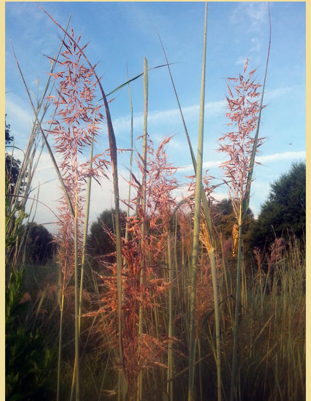
Can you see the grasshopper in the Indian grass ( Sorghastrum nutans )?

A full list of herbaceous species in the meadow can be found on the Arboretum Explorer site. Go to uky.arboretumexplorer.org . From the Search tab, go to the Location drop-down menu and select SH-1.01 Wildflower Meadow.