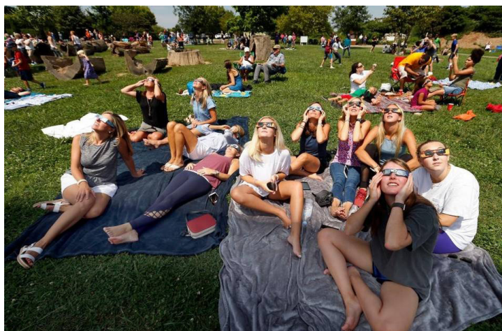
Eclipse watchers at The Arboretum on August 21, 2017.

The Arboretum hosted a Solar Eclipse Celebration on August 21, 2017. Over 1,200 community members joined us to watch this captivating celestial performance. The first 100 participants were given solar glasses. We also distributed 50 pairs of glasses to share, marked with a neon dot so that participants knew to share them.