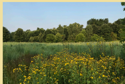
Black-eyed Susan ( Rudbeckia hirta var. pulcherrima) and ox-eye ( Heliopsis helianthoides) in the Shawnee Hills Meadow

that will resurface in the spring. Burning the meadow also has the benefit of cycling the nutrients from the dead plants back into the soil. (continued on Page 4)