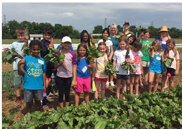
Junior Master Gardeners and their camp leaders visit UK South Farm.