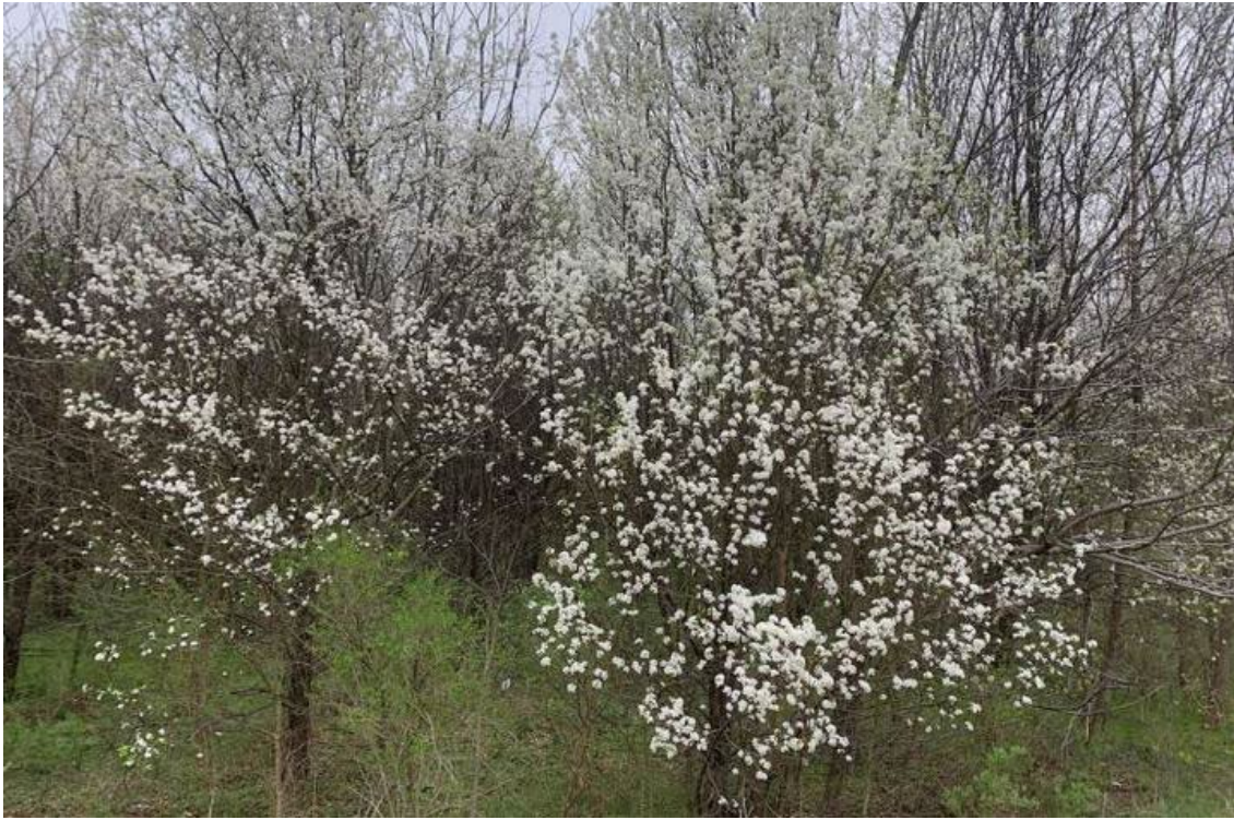
Above photo: a proliferation of Callery pear trees (photo credit: Ellen Crocker); bottom photo, Callery pear removal in progress in The Arboretum's Bluegrass swale.