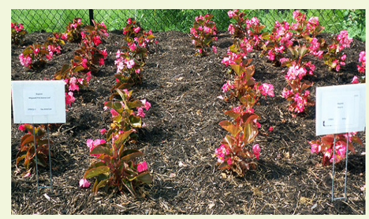
2017 All-America Selections Ornamental Seed Trial begonia entry. The entry is on the sons to the new varieties are selected, seeds are right, the first of three comparisons is on the left.

entry against comparison entries also being grown, with regard to bloom characteristics, disease resistance, plant habit and other traits. Most trial entries are evaluated for only one year although herbaceous perennial trials will extend over three seasons.