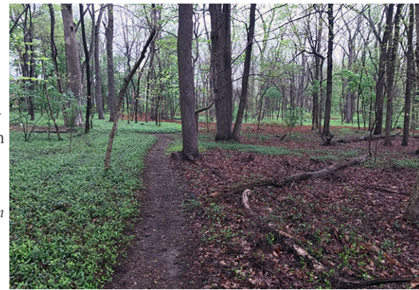
April 2017: Non-sprayed (left side) and sprayed wintercreeper in The Arboretum Woods. Spraying took place in late February 2017.

Graduate student Adam Baker and Professor Dan Potter (UK Department of Entomology) are partnering with The Arboretum to evaluate eight species of milkweed for their conservation values in Monarch Waystations and butterfly gardens. They are comparing