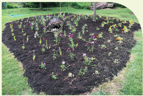
New Collection Garden in the KCG.

Because The Arboretum is an educational garden open to the public, and visitors are not allowed to remove any items, be they flowers, rocks, leaves or pawpaws! This prohibition holds true for the Kentucky Children's Garden (KCG) as well, with one special exception: the KCG now offers a Cutting Garden. This garden provides an opportunity for Children to take something home with them by allowing them to cut a flower to keep. The Cutting Garden is located at the top of the garden by the Arbor Day tree. It features colorful annuals—bachelor's buttons, marigolds, cockscombs, cosmos, scarlet clover, nastur-