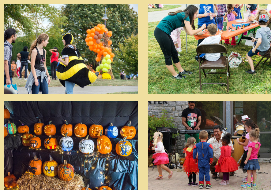
Shown above are some of the memorable moments from the 2016 Party for the Pumpkins.

to join. This is our Year of Friendraising, and we are making a special effort to welcome new members.