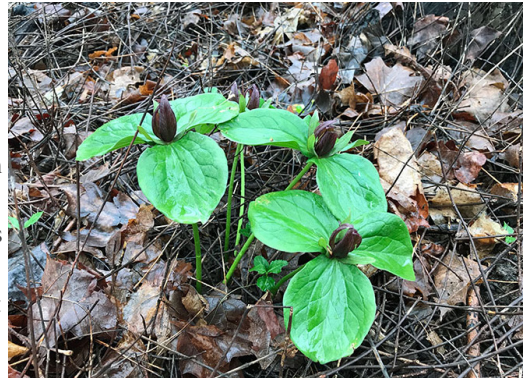
Southern trillium in the Woods.

milkweed varieties' relative attractiveness to egg-laying monarch butterflies, the suitability of each milkweed type as food for their caterpillars and how each milkweed species performs in Kentucky gardens. Results of this research are intended to help land managers and pollinator enthusiasts choose the milkweed species best suited to their gardens and ultimately to add valuable pollinator habitat to the landscape.