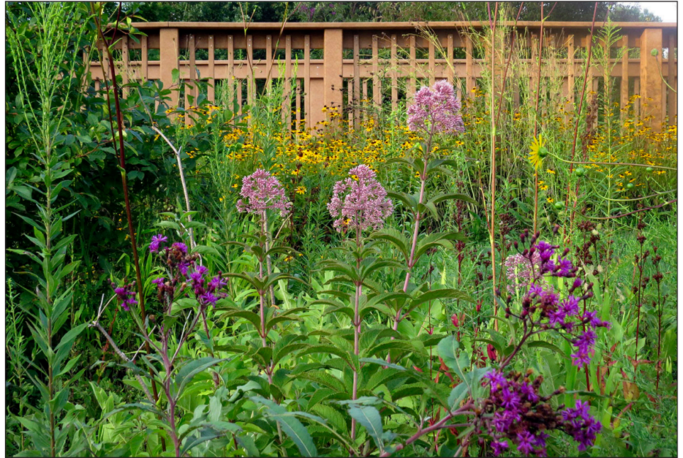
Mississippi Embayment wetlands and pedestrian bridge.

Over time, plant roots have become established and anchored, native plants have filled in and crowded together, and trees have grown up and out and established a canopy. Every year more turf is replaced as the wetlands' herbaceous borders expand, thus reducing mowing needs and increasing habitat and food for wildlife. The challenges of this ambitious project were met with dedicated weeding and patience, and a committed staff and volunteer base, resulting in a magnificent display.